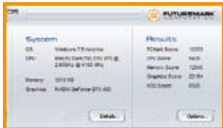
An impressive score for PCMark05

Overall, we found the ASRock Extreme4 to be a very interesting motherboard. With a plethora of high-end features, and a good performance score on PCMark05, this new motherboard from ASRock seems to be a good choice for most mainstream users. However, we think that the board layout could have been slightly better to allow for full usage of every PCI slot.