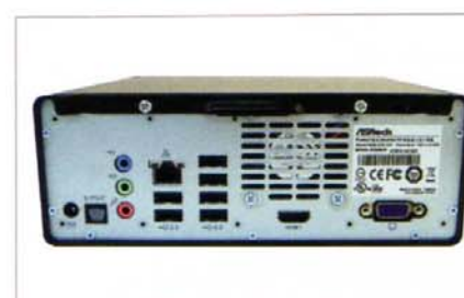
The ASRock ION 330-BD boasts a healthy number of USB ports, but they should have dumped the VGA output port and opted for a DVI one instead.