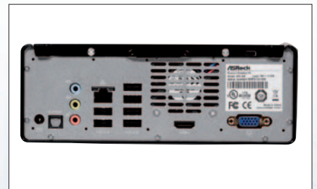
Plenty of USB ports to add to the HTPC experience

Apart from low power consumption and noise operation levels, the clutter-free HDMI connection and excellent Full HD video acceleration performance makes the ASRock nettop a potentially serious contender to the living room entertainment throne. Just add-in a wireless network USB adapter and a wireless keyboard and mouse, and the NetTop ION 330 may just be the HTPC you're looking for.